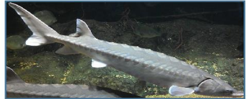
Atlantic Sturgeon swimming.