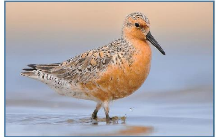
Rufa Red Knot.